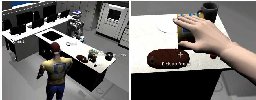
Fig. 3: Left: third-person view of the human component that is used to navigate in the environment, displaying the names of objects that the human can interact with. Right: first-person perspective of the human avatar that indicates a possible “pick-up-action” with the bread.

For human-robot-interaction scenarios, we require a way to combine the reactive and sometimes unpredictable behavior of a human interacting with its environment with a simulated robot. Therefore the human avatar of the MORSE simulator has been equipped with an intuitive control that enables users to act upon the simulated environment. Inspired by modern 3D-computer games, the user takes a third-person perspective behind the human avatar to move around as shown in Fig. 3 (left). While moving around, the camera tries to avoid the objects and walls placed between the camera and the human avatar to prevent occlusions. All objects that can be interacted with can be displayed by pressing a key on the keyboard (also illustrated in Fig. 3). When the user decides to interact with an object, the camera switches to a first-person perspective and offers an interface showing possible actions the user can take when pointing to specific objects, as shown in Fig. 3 (right). Those actions at the moment include picking up and releasing objects, opening and closing drawers and cupboards and switching on and off specific objects like a light or an oven.