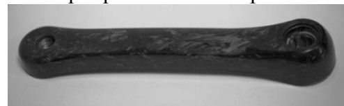
Figure 1: pedal crank made with recycled Carbon Fibres (developed at I2M) (Perry 2012)]

In order to integrate LCA information into the product design stage, necessary information must be properly represented and associated to the product PLM information. In the proposed research, a case study was first conducted to examine what LCA information should be modeled. Composite parts give interesting examples on a simple piece such as a pedal crank developed with recycled carbon fibers for thermoset organic matrix composite as shown in Figure 3. During the design, product models have to integrate materials information such as matrix composition, reinforcement type (glass, carbon, aramid, and natural), their architecture (unidirectional, woven) and the structure composition (orientations of the different layers in the depth of the product). Other information like inserts or coating completes the bill of material. Currently in STEP AP 203, only very limited material information is modeled as shown in the following entities in table 1. To associate composite material information to a product design, the following entities were developed in this research. The new entities are written in bold-italic.