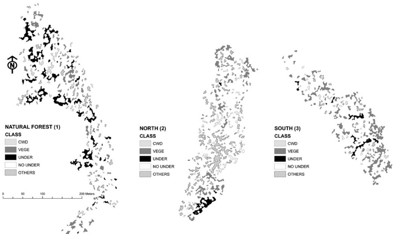
Fig. 2 Forest landscapes and classification of canopy gaps into the five types based on the field inventory: DDW downed deadwood; VEGE seedlings and vegetation; UNDER VEGE and DDW; NO_UNDER no seedlings, vegetation, or DDW; and OTHERS gaps with some DDW or seedlings

intuitive interpretation than the Shannon’s Index. Specifically, the value of the Simpson’s index represents the probability that any two randomly selected pixels represent different patch types. In addition, Stiling (1996) noted that the value of species diversity (SHDI) is often between 1.0 and 6.0, and the maximum diversity of a sample exists when all species areas are equally abundant.