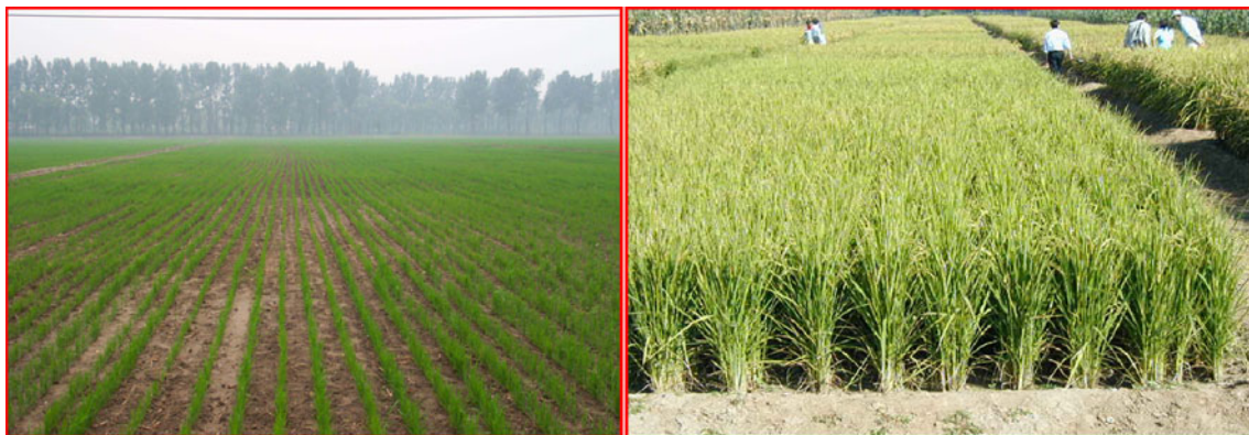
Fig. 1 Aerobic rice in a farmer's field ( left ) and experimental plots ( right ) in Beijing, China

By reducing water use during land preparation and limiting seepage, percolation, and evaporation, aerobic rice had about 51% lower total water use and 32–88% higher water productivity, expressed as gram of grain per kilogram of water, than flooded rice (Bouman et al. 2005). The labor use is also saved in aerobic rice because more labor is required for land preparation such as puddling, transplanting, and irrigation activities in flooded rice (Wang et al. 2002). Furthermore, aerobic rice cultivation has another