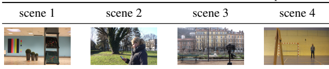
Table 1. The four different scenes at the basis of our stereoscopic database.

For capturing the database images (at the resolution of 1080p), we used a compact Fujifilm FinePix Real 3D W3 camera, having a lens separation of 7.5 cm. All the images were intended to be as natural as possible, as taken by ordinary users, thus placing the experiment in a consumer utilization context, from the point of view of the content to be visualized.