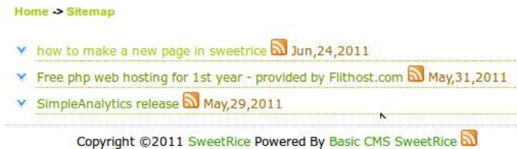
Figure 2. Sitemap of SweetRice which contains a list of all articles

1 // comments in sweetrice are labeled #1, #2, etc 2 HtmlElements referenceElements = browserSource.query(clickable("#")).find(); 3 for (HtmlElement referenceElement: referenceElements) { 4 HtmlElement commentInfoElement = browserSource.query(rightOf( referenceElement), text()).findFirst(); 5 HtmlElement commentTextElement = browserSource.query(rightOf( commentInfoElement), text()).findFirst(); 6 7 String commentAuthor = commentInfoElement.getTextFirstLine(); 8 Date commentDate = commentInfoElement.extractDate(); 9 String commentText = commentTextElement.getText(); 10 }