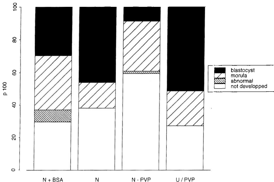
Fig 2. Morphological evaluation of the development of porcine one- and two-cell embryos after 6 days of culture in different media. In medium N-PVP, the development is significantly reduced ( P < 0.05 ). BSA: bovine serum albumin; PVP: polyvinyl-pyrrolidone.

The qualitative observations are summarized in figure 2. The results were similar to those recorded in table III. Medium N and Medium U/PVP yielded approximately 50% blastocysts. Medium N-PVP (medium N with PVP instead of BSA) produced a limited percentage of blastocysts ( P < 0.05 ). A fully synthetic medium, therefore, allowed the development of one- to two-cell embryos up to the blastocyst stage; the number of cells per blastocyst was only slightly lower than that obtained with very high BSA levels in the medium.