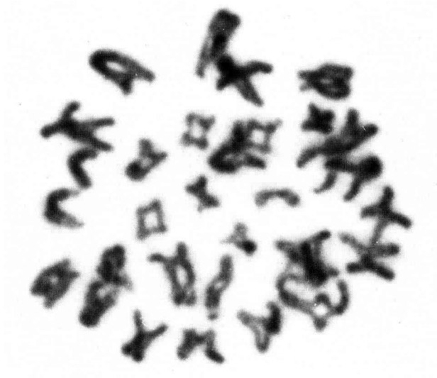
Fig 1. Chromosomes from a bovine oocyte at diakinesis after in vitro culture for approximately 10 h.

There was no statistical difference between the percentage of oocytes at diakinesis (fig 1) after 8–12 h of culture ( \chi^2 = 1.76 ; P = 0.1 ) or at metaphase II (fig 2) after 19–25 h of culture ( \chi^2 = 0.74 ; P = 0.1 ) with FCS or ECS.