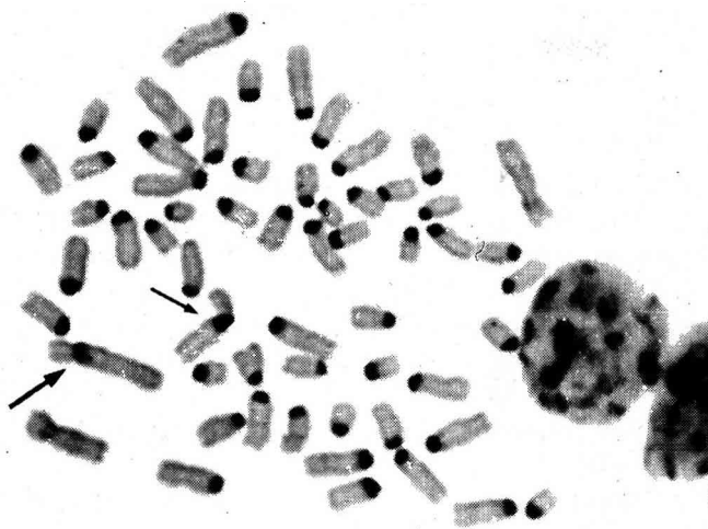
Fig. 3. CBG-banded metaphase showing constitutive heterochromatin as one block in the 1/29 translocation (large arrow) and two blocks in the 9/23 translocation (small arrow).

cation which does not confer any advantage to heterozygous carriers, produces in certain breeds a reduced fertility in the daughters of carrier bulls (Gustavsson, 1969; Refsdal, 1976).