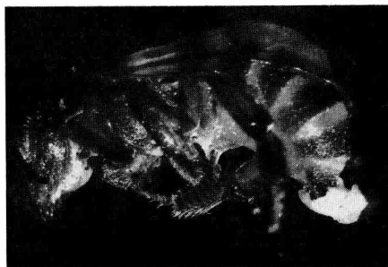
Fig 2. Adult worker emerged from diflubenzuron treated pupa with a lump of white tissue at the abdominal end.

In pupae of A mellifera treated with 6 \mu\text{g} DF per pupa adult emergence was 13%, with 9% workers showing morphological defects. Treatment with 4 \mu\text{g} DF produced 33% worker bees, of which 5% had morphological abnormalities. In these bees, a white lump of unrecognisable identity was detected entangled with the stylet and lancets of the sting apparatus (fig 2). This may have been the evaginated reproductive system or shed cuticle from the integument or the hindgut of the pupa. However, apart from the stylet and the lancets which were not properly interlocked, the sting apparatus appeared normal. In pupae of A c indica treated with 4 \mu\text{g} DF each, adult