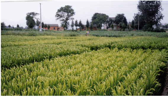
Figure 3. High yielding rice cultivars grown under subtropical conditions in Jiangsu Province, China.

conditions and take into account the risk of growth-limiting (e.g.: drought, heat) and growth-reducing (e.g.: weeds, pests, diseases) conditions.