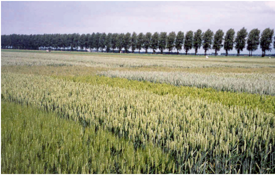
Figure 2. High yielding wheat cultivars grown under temperate climatic conditions in the Flevopolder, The Netherlands. For details: see Spiertz and Ellen (1978).