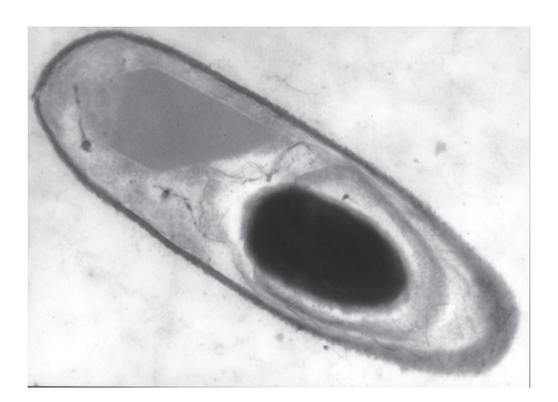
Figure 1. Transmission electron micrograph of a longitudinal section of Bacillus thuringiensis towards the end of sporulation, showing the spore (black ovoid structure) and the protein crystal with insecticidal properties (bipyramidal inclusion).

by the Japanese bacteriologist S. Ishiwata (Ishiwata, 1901). It was subsequently rediscovered in 1911 by the German biologist Berliner, who isolated it from infected chrysalids of the Mediterranean flour moth, Ephestia kuehniella (Zell.), collected from a mill in the province of Thuringe (Berliner, 1915). He called this bacterium Bacillus thuringiensis. Agronomists soon became interested in the entomopathogenic properties of Bt, because small amounts of preparations of this bacterium were sufficient to kill insect larvae rapidly. The first formulation based on Bt was developed in France in 1938, under the name "Sporéine", but the first well-documented industrial procedure for producing a Bt-based product dates from 1959, with the manufacture of "Bactospéine" under the first French patent for a biopesticide formulation. Commercial formulations of Bt consist of spore/crystal preparations obtained from cultures in fermentors; the preparations are dried and used in a granulated or wettable powder formulation for use as a spray. \delta -endotoxins are highly diverse, resulting in a generally restricted activity spectrum for each individual toxin, and are innocuous to plants, animals and almost all non-target insects (bees, ladybirds and other auxiliary biological control agents) (Marvier et al., 2007). The industrial-scale production of Bt is now well controlled and relatively simple, and is competitive in terms of cost, and this obviously contributes to its success.