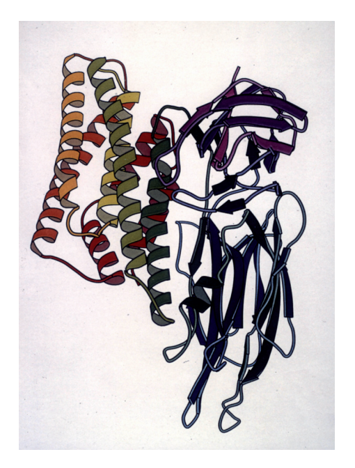
Figure 2. Three-dimensional structure of activated Cry3Aa toxin. Schematic diagram showing the three domains of the protein.

tors and this binding is followed by proteolysis, resulting in a conformational change facilitating toxin oligomerization. The resulting oligomers have a higher affinity for the aminopeptidase N-type receptor, and probably for other glycolipid or