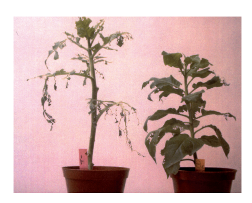
Figure 3. Transgenic tobacco transformed with the cry1C gene. On the left, an untransformed control plant. On the right, tobacco transformed with the cry1C gene, modified for expression in plants. In both cases, 40 Spodoptera littoralis second instars were placed on the leaves. The photograph shows the damage after 72 hours.

(521 000 ha), the western spruce budworm, Choristoneura occidentalis (Free.) (547 000 ha) and L. dispar (2 435 000 ha). In Canada, between 1980 and 1999, almost 6 million hectares of forest were treated by aerial spraying with products based on Bt . It is also estimated that 1.8 million hectares of forest in Europe (corresponding to about 26% of the area treated) were treated with Bt -based products between 1990 and 1998 (Van Frankenhuyzen, 2000).