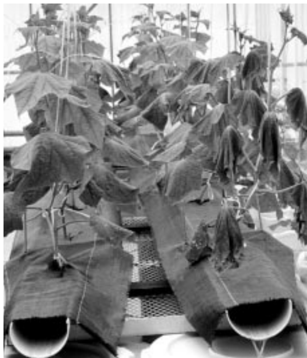
Figure 1. Pythium-infected cucumber plants (right) grown in an NFT recirculating system compared to no Pythium (left).

Over the years, and most intensely in the last decade, various techniques have been studied for their ability to minimize the spread of root pathogens in recirculating nutrient systems. Some of these techniques are now used successfully in commercial greenhouse facilities but others are still unproven or show problems in a commercial setting. They fall into five broadly based categories, namely heat, chemical, and radiation treatments which