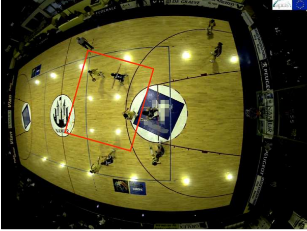
Fig. 1: Fisheye image.

We focus now on the problem of the generation of perspective planar images in any direction covered by a fisheye sensor. In our case, the original data comes from a perfect fisheye lens \mathcal{S}_{\text{Fish}} . Figure 1 shows an example of a fisheye image (APIDIS basket ball dataset 1 ).