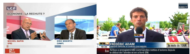
Figure 1: Two sample screen shots

ing the true speaker name for at least some of the clusters. A first system using automatic speech transcription (ASR) and manual rules for extracting speaker names from the transcription was proposed in [1]. An evolution of this approach using semantic classification trees (SCT) was presented in [2]. Both methods detect named entities in the ASR and use linguistic information to find the true name of a speaker. However, the frequent errors in the automatic transcription of proper names limit this approach. To prevent this issue, [3] combined subtitles and manual audio transcripts for face recognition in TV series. These sources of information can be found in TV series or movies, but generally not in news or talk shows. Automatic transcription of overlaid texts can provide names information with a high reliability (see figure 1). Indeed, TV broadcast news, reports or talk shows often use an overlaid text to introduce a person. In this paper, we address an unsupervised speaker identification method in videos with the help of overlaid texts obtained via video OCR. The core aspect of this approach is that no a priori speaker models are needed. Only speaker diarization and video OCR technologies are used.