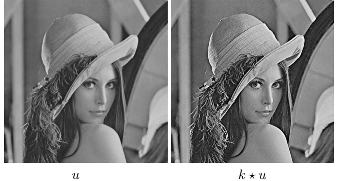
Fig. 2. Blind deconvolution of Lena image. Selecting the separable symmetric 21 \times 21 kernel k that maximizes the Sharpness Index of k \star u ( u being the original Lena image, bottom left) results in a sharper image (bottom right) that reveal some details of the original image, while keeping noise and ringing at an acceptable level.

perspectives, both from a theoretical viewpoint (the explicit formulas will probably ease further analyses) and as concerns applications (in particular image restoration), for which computation time and estimation errors are no more a limitation.