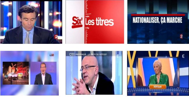
Fig. 3. Typical structural events. From left to right and up to down: anchor person in news, 2 flash news screens for 2 different programs, magazine anchor person, guest in a talk show, contestant presentation in a game.