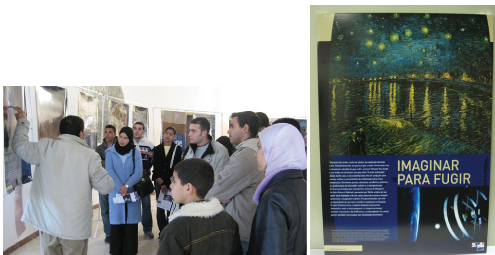
Figure 4. (Left): Presentation by IFO and FCO at the Université des Sciences de Oudja (Morocco). (Right): Translated copy of CMC touring in the framework of Brazil-France year.

During this operation, scientists or specialists in the history of astronomy also delivered 13 lectures and three 1- or 2-day training sessions were set up for activity organisers and leaders. A wide variety of workshops was offered in each location: Two or three days of scientific workshops, such as sky maps or sundials and sometimes water-rockets workshops; Art workshops such as science-fiction model building making use of daily life