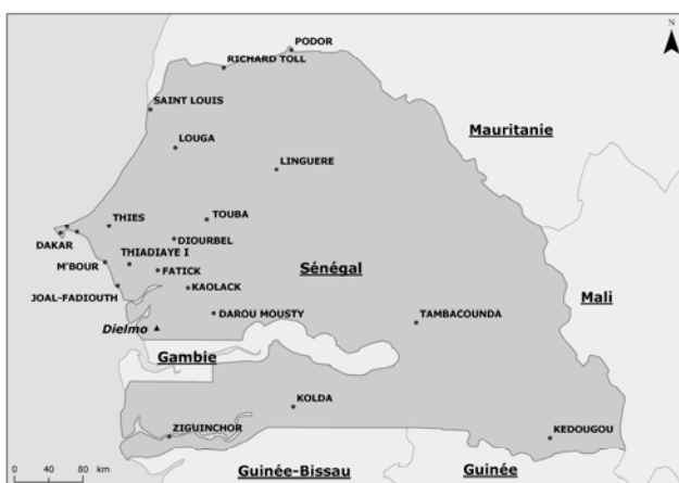
Map 1: Location of Dielmo in Senegal

Dielmo (13°45'N, 16°25'W), a village of about 300 inhabitants, is situated 280 km on the southeast of Dakar in the Sahelo-Soudanian region of Senegal (Map 1).