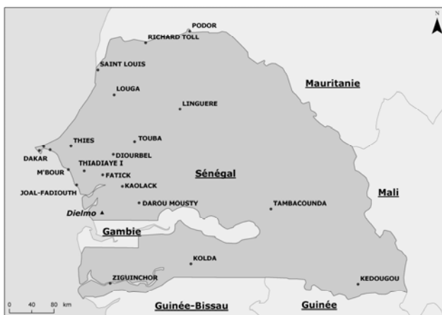
Map 1: Location of Dielmo in Senegal

Dielmo (13°45'N, 16°25'W), a village of about 300 inhabitants, is situated 280 km on the southeast of Dakar in the Sahelo-Soudanian region of Senegal (Map 1).