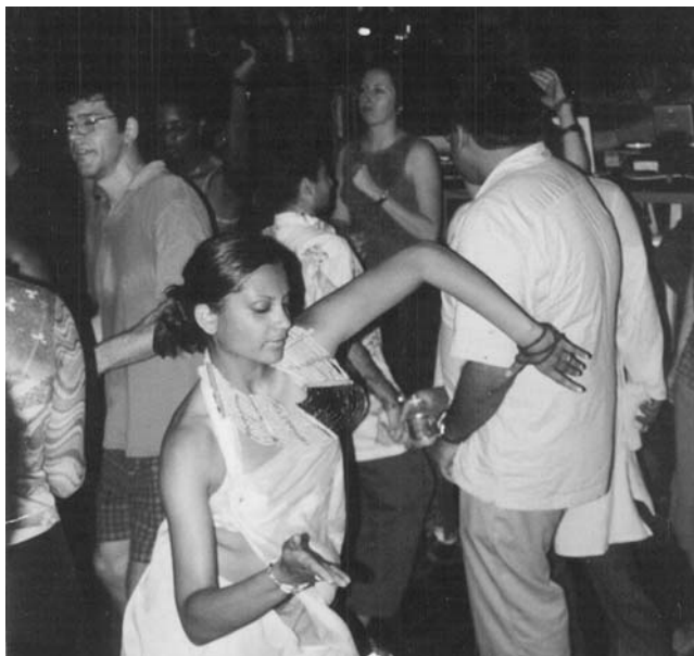
Figure 3 Mutiny in full swing

Those who sympathized with ‘rooting’ this scene to South Asia argued that an anti-essentialized labelling would create just another public space, subject to racist public norms. Though Gilroy’s (2000: 12–13) argument that antiracist efforts are best pursued without ‘rooting’ culture is poignant, these respondents felt that exclusively ‘rooting’ this scene would sacrifice the significance that: (1) this scene was ‘started by the South Asian diaspora’ and (2) it holds a special political, social and cultural significance for Asians. Rajini elaborates on the latter point, stating that ‘having brown skin can act as a link [. . .] in this type of environment’. A similar situation occurred in bhangra scenes, 24 where bhangra music was viewed by many Asians as something essentially Asian. In the words of one of the lead singers of the UK bhangra outfit Cobra, ‘Bhangra is Asian music for Asians’ (Sharma, 1996: 35).