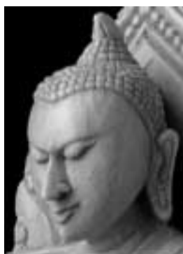
Fig. 9 Detail of a standing Buddha 'walking', 15.4 cm x 5 cm