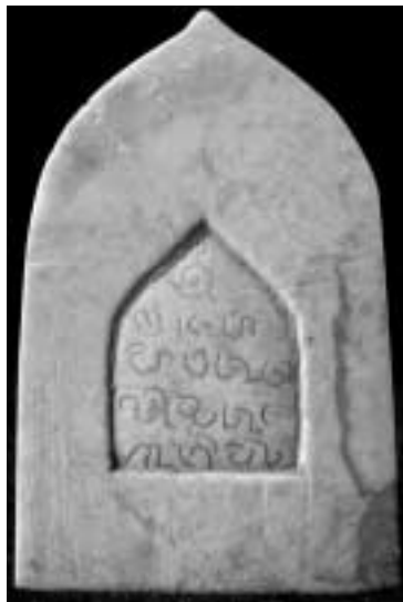
Fig. 5a-b The Enlightenment , 4.1 x 2.7 cm