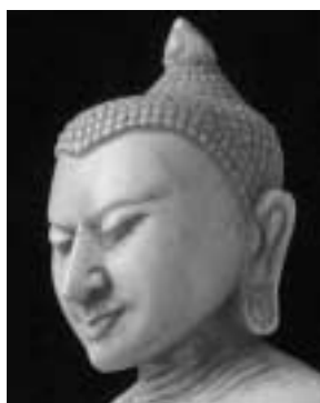
Fig. 7 Detail of Fig. 15