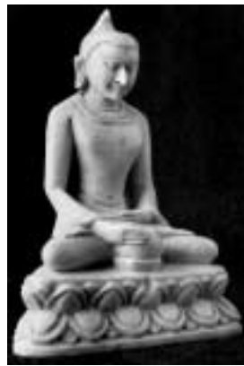
Fig. 20 The Buddha taking food, 5.1 x 3.7 cm