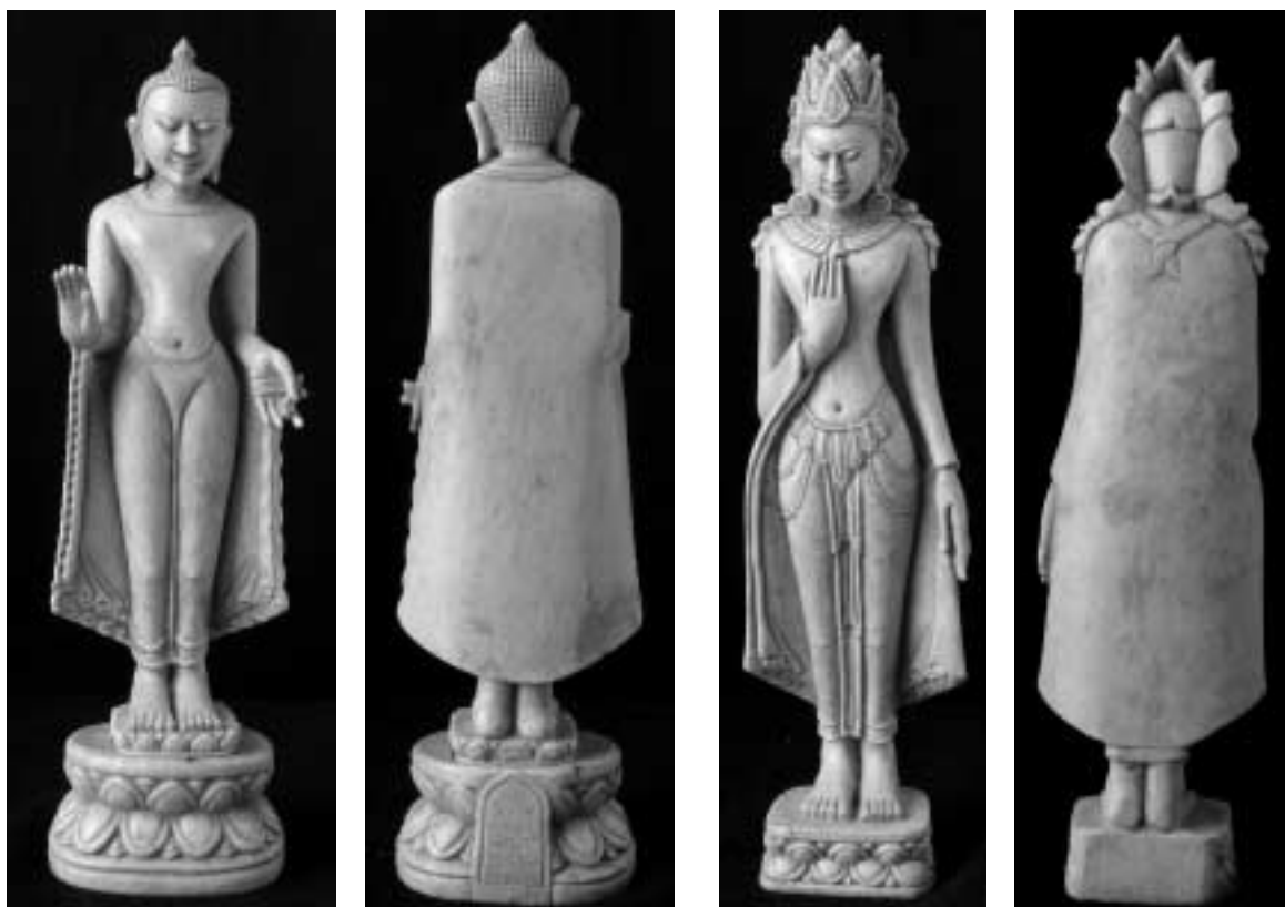
Fig. 15a-b Standing Buddha showing abhayamudrā , 18.5 (with pedestal) / 16.1 (without pedestal) x 5,5 cm (largest width at level of robe). See also Figs. 3 & 7