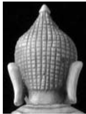
Fig. 11 Detail of Fig. 1 Fig. 12 Detail of Fig. 14 Fig. 13 Detail of Fig. 22

clearly drawn through straight lines, and, when seen in profile, is straight with its tip rounded or slightly curved. The lower lip is thick, the upper one very thin; their corners are drawn upwards. Seen from the front, the lines of the upper lips and of the eye-brows can be parallel; or the lower full lip can follow the line of the pointed chin. Moreover, the eyeballs are directed downwards, hidden by the upper lid, which makes them practically invisible when seen from the front and possibly creates a thick dark line. The hairline is bow-shaped and parallel to the eye-brows.