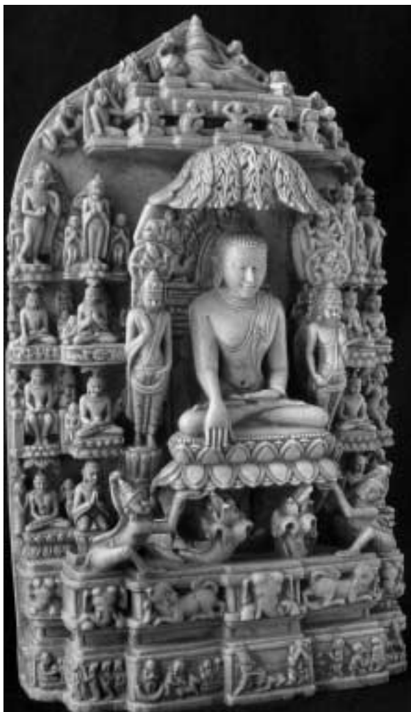
Fig. 1 The Enlightenment, surrounded by further scenes of the Buddha's life, including the 'Great Events' and the 'Stations', 20.2 x 12.2 x 4.7 cm

Loka-hteik-pan. 10) In those monuments, the stucco image of the shrine (with bhūmisparśa-mudrā , i.e. symbolizing the Enlightenment at Bodhgaya) and the murals painted on the wall behind this image (and illustrating seven further events of the Buddha's life) are combined in a single composition.