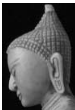
Fig. 8 Detail of Fig. 22