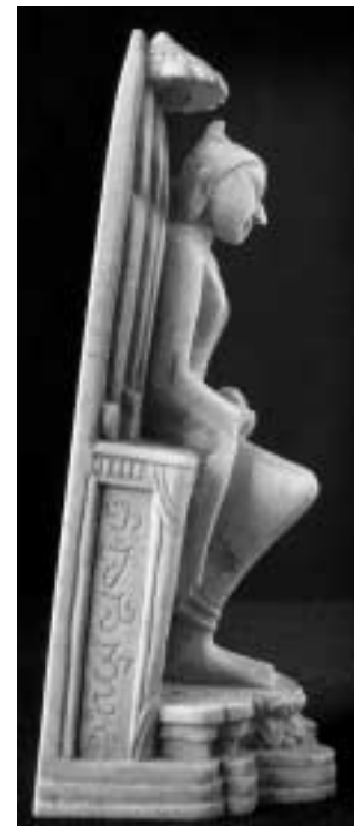
Fig. 14 Side view of Fig. 21

The polished surface of the images makes them very smooth to the hand. The image and its setting form a harmonious and elegant composition; the lines never show acute angles but follow sinuous movements, in particular in the standing images, enhancing the shape of the body in front of the dress falling straight around and behind it (Figs. 15a-b, 16a-b). The deep carving creates a thick shadow around the body. A strong tendency towards strict symmetry is also noticed: considering the standing images displaying the abhayamudrā ('gesture of fearlessness'), for instance, indicates how