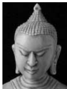
Fig. 10 Detail of Fig. 22

a feature that will be emphasized in the following centuries. 19) Similarly, the wooden, metal or/and stone images distributed in the Shwezigon, Ananda, Naga-yon and Kyauk-ku-umin, as well as all 'andagū' images studied in the present paper, show the head with pointed chin clearly put above the neck adorned with three incised lines. As to the 'short neck' Buddha which is encountered in sculpture (stucco images in shrines; 'andagū' and cast images) and in the murals of the site, it emerged in the course of the 12 th century as a local development. 20)