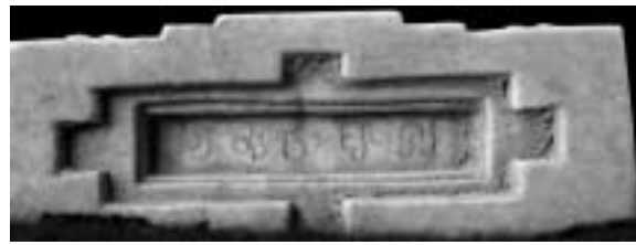
Fig. 2 Lower surface of the pedestal below the image illustrated in Fig. 21

A fairly large number of these images bear inscriptions distributed in the lower part, i.e. on the front or/and sides of the pedestal (Fig. 14b), on the lower surface of the sculpture, or on the back (Figs. 2-3, 5b). While the work of deciphering these inscriptions is still in progress, one cannot exclude the possibility that some reproduce yantras similar to those integrated in Buddha images of