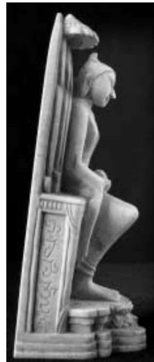
Fig. 14 Side view of Fig. 21

The polished surface of the images makes them very smooth to the hand. The image and its setting form a harmonious and elegant composition; the lines never show acute angles but follow sinuous movements, in particular in the standing images, enhancing the shape of the body in front of the dress falling straight around and behind it (Figs. 15a-b, 16a-b). The deep carving creates a thick shadow around the body. A strong tendency towards strict symmetry is also noticed: considering the standing images displaying the abhayamudrā ('gesture of fearlessness'), for instance, indicates how