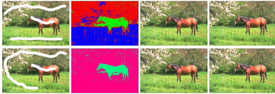
Fig. 3. Influence of the number of markers on the results (from left to right): input image with markers, classical supervised pixel classification, classical marker-based watershed segmentation, and proposed approach.