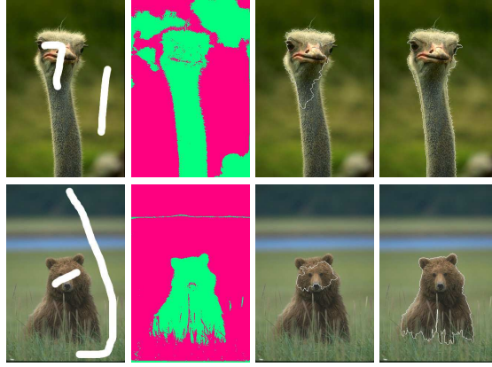
Fig. 1. Comparative results (from left to right): input image with markers, classical supervised pixel classification, classical marker-based watershed segmentation, and proposed approach.

The computational cost of the proposed approach is of course higher than the classical marker-based watershed as it also involves a supervised pixel classification. However, it is still reasonable and as been measured around 15 seconds with a Java-based implementation on a Pentium M 1.1 GHz / 1 GB RAM laptop.