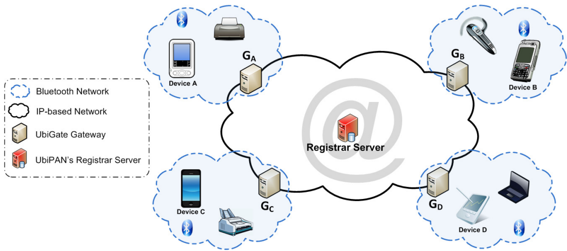
Figure 1. Overall architecture of UbiPAN

Area Networks by combining the use of wired and wireless communication technologies. We rely on the use of the IP network, the SIP [4] protocol and Bluetooth.