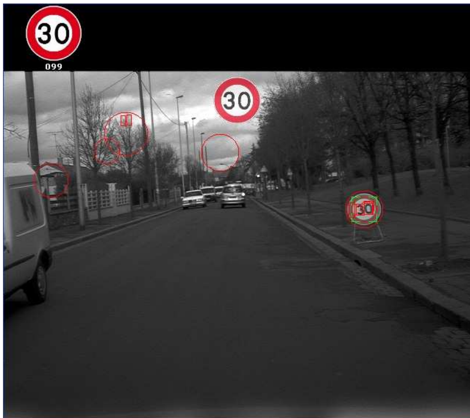
Figure 7: Speed limit sign detection on E.U. street; this example also illustrates the interest of visual detection the case of temporary roadwork

Most of the 11% non-correct-detections are just missed signs (sometimes because of not contrasted enough edges of the sign, and most of the time because of noise or occlusion impeding digit segmentation). The misclassification rate (signs for which a wrong speed value has been validated) is below 1%. And, most importantly, not a single validated false alarm has been noticed in the 150 minutes of daytime recording: all spurious signs are efficiently filtered by our tracking and validation module. Note that these 150 minutes of analyzed recording are not consecutive, but selected around moments when speed limit signs are visible, and cover various illumination conditions and types of roads and environment. Also, several experimental real-time on-road tests aboard an experimental car have been conducted, for a total of many driving hours, and were quite satisfactory.