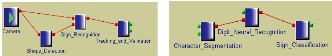
Figure 1: Global modular architecture (left) and detail of the Sign_Recognition block for the E.U. case (right).

The modularity of our system allows to easily adapt it to different types of speed-limit signs (e.g. U.S. vs E.U. speed-limit signs), or even detection of other kind of traffic sign.