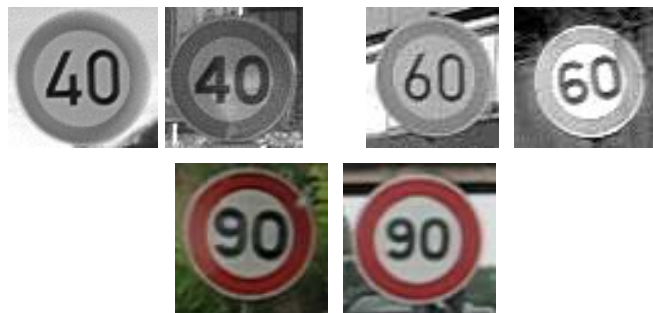
Figure 3. Illustration of the variability of global aspect of the same speed-limit sign digits, both across different E.U. countries and even inside a given country: on top German signs (left of each pair) compared to their French equivalent, and on bottom two variants of the French 90 speed-limit sign.

This design choice (using digit extraction and recognition instead of global sign recognition) proves to be an advantage also in Europe, where there are actually some differences in global aspect of the same sign among different countries, and even inside a single country such as France for instance (see figure 3). Even though we presently train a specific neural network for speed sign digits recognition (see below), a final pan-European system could probably work with a “universal” digit recognition module, therefore not requiring the previous collect of all European variants of each sign.