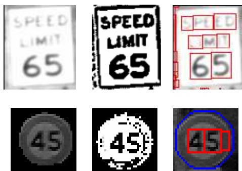
Figure 4. Illustration of the character segmentation procedure in a rectangle (U.S. case, top line), and in a circle (E.U. case, bottom line): the searched area (left) is first binarized by adaptive thresholding (middle), then connected-component labeling is applied for finding potential digits (right).

The neural network ODR module is a multi-layer perceptron (MLP) with 10 output (1 for each digit value) trained on specially built databases of digits extracted from relevant speed-limit signs in videos recorded from on-vehicle camera. For example, our current E.U. digits database, constantly enriched with new examples extracted from video recorded in different European countries, currently contains a total of 2762 digits examples and 2789 negative (non-digits) examples.