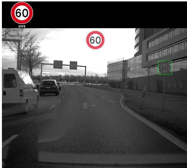
Figure 8. Correct recognition of a German speed-limit sign illustrating promising results for pan-European speed-limit recognition.

The above results were quantified only on French videos, but evaluations in other E.U. countries are currently under way, with very promising results (see figure 8 with an example in Germany).