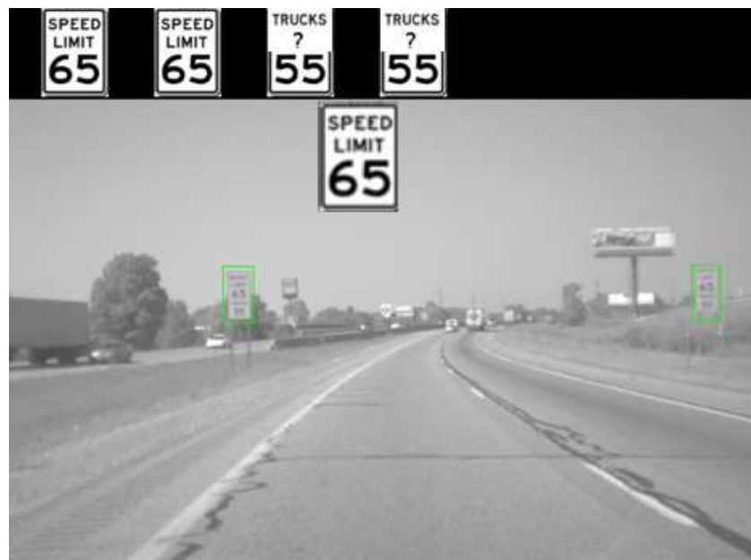
Figure 6: Detection and recognition of another variant of U.S. speed limit sign, with exactly the same system.

A more thorough evaluation has been done for the E.U. system, using ~150 minutes of recordings on French roads and streets, under various daytime illumination conditions, and