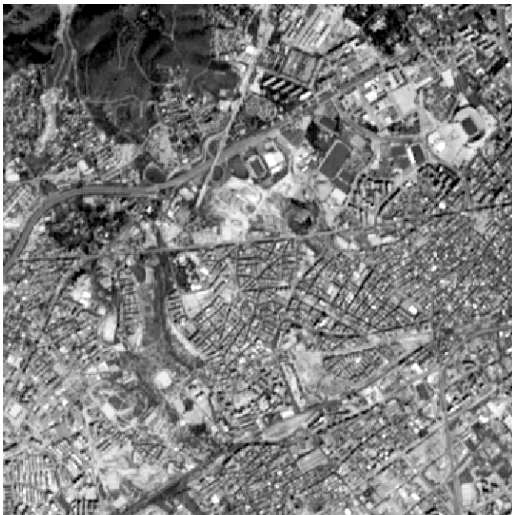
Figure 3. XP1 synthetic image (see text for explanations).