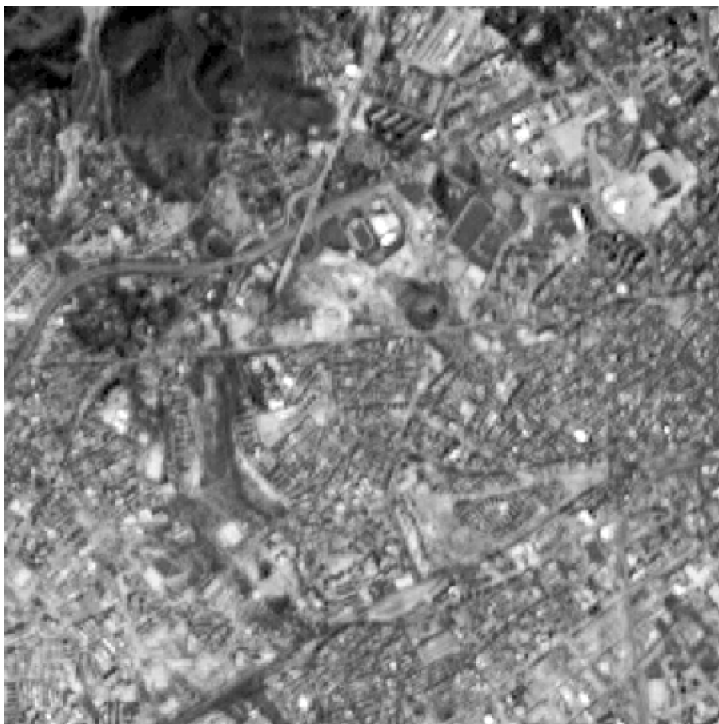
Figure 4. As Figure 3 but XS1-HR.