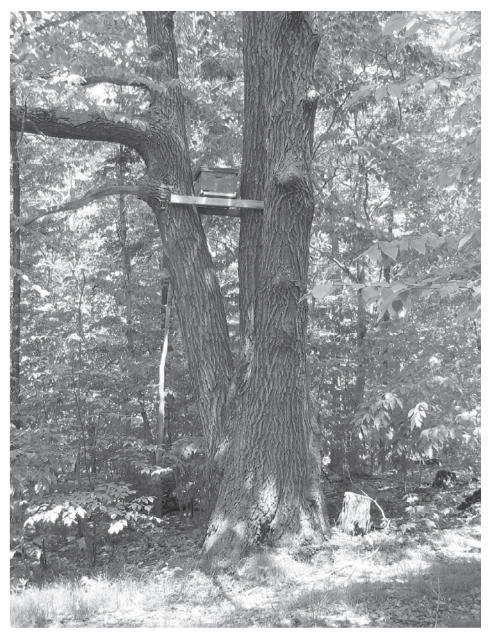
Figure 1. One of five bait hives installed in trees in the Arnot Forest to attract swarms and so provide feral colonies living in movable-frame hives. Installation shown is typical: hive mounted some 4 m off the ground and with entrance opening reduced to 16 cm<sup>2</sup> and oriented to south.

not by themselves indicate a living colony within they could be robber bees or scout bees, plundering or inspecting the nest of a dead colony - so I used the criterion of the presence of pollen foragers as my indicator of a live colony. The nests of colonies that had died were kept in the inspection program to provide data on the occurrence of nest reoccupation. The May 1 inspection preceded the swarming season for the Ithaca area (Fell et al., 1977), so all colonies alive at that time were assumed to have survived the winter. The mid-June inspection served to check for late spring mortality among colonies that survived winter. The October 1 inspection provided data on nest reoccupation and colony survivorship for the preceding summer. A prior study of the demography of feral colonies in central New York State (Seeley, 1978) found that