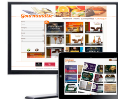
Figure 3. The gourmandise application

Precisely, Ubidreams developed a product catalog (see figure 3) accessible from regular browsers and from iOS devices (as a native application). The feature set differs in the web site and in the iOS application and also depends on the user's roles. The web site offers a management system where authenticated users can add, update and remove products. This part of the application is a business-driven CMS developed for the project. The iOS application focuses on products browsing and viewing.