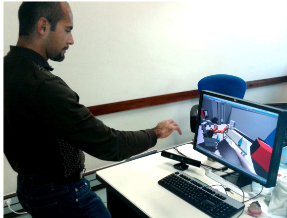
Figure 1: The experimental setup with the human avatar controlled from a Kinect.

YARP, as well as a socket-based raw protocol. This design allows in principle to use the same software in both the real robots and the simulator. Instructions given to the robot are interpreted in the simulator to provide the control of actuators, such as the motion of the robot and its arms. The data from simulated sensors is sent back through the middlewares, e.g. exporting the images from cameras, or the positions of the robot, human and other objects of interest.