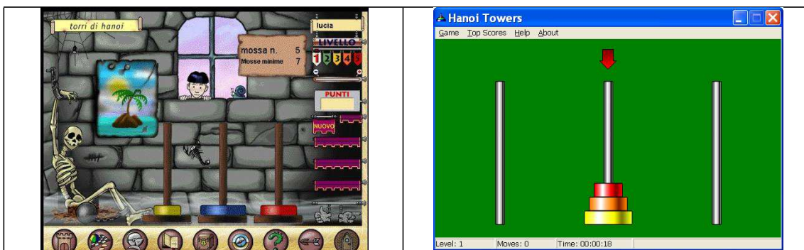
Fig. 1 Different interfaces for the same game (Hanoi Towers)