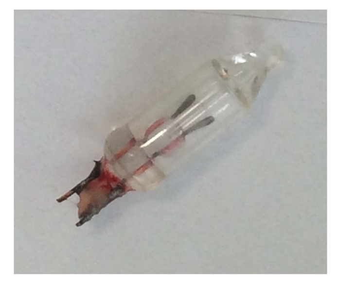
Fig. 2. The LED bulb from the Christmas light garland decorating the Christmas tree removed from the left main bronchus.

bronchus has been reported, but monitoring such cases may be of interest to possibly reconsider the shape of some LED bulbs.