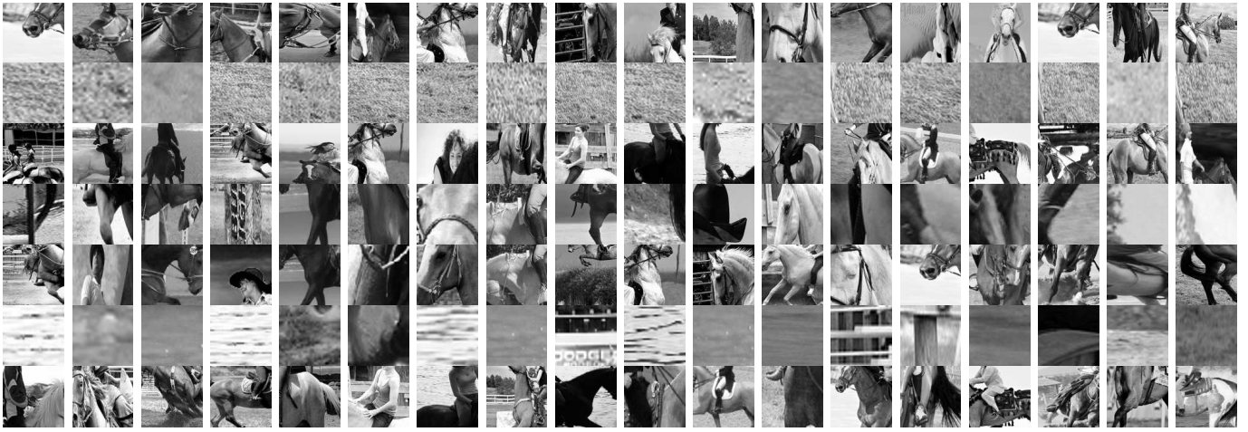
Fig. 2. This figure shows the highest scoring regions for a set of parts learned for the riding horse action. Each row correspond to a part