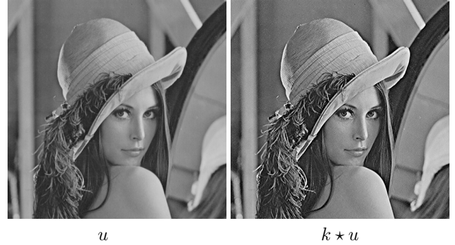
Fig. 2. Blind deconvolution of Lena image. Selecting the separable symmetric 21 \times 21 kernel k that maximizes the Sharpness Index of k \star u ( u being the original Lena image, bottom left) results in a sharper image (bottom right) that reveal some details of the original image, while keeping noise and ringing at an acceptable level.

perspectives, both from a theoretical viewpoint (the explicit formulas will probably ease further analyses) and as concerns applications (in particular image restoration), for which computation time and estimation errors are no more a limitation.