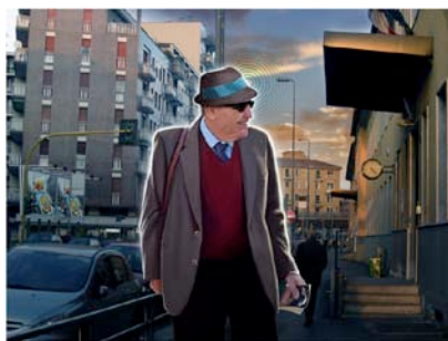
Figure 2. Exemplary images of potential applications of CURVACE as sensors integrated in flying microrobots for vision-based navigation (left) and vision-based collision-alert system for visually impaired people (right).