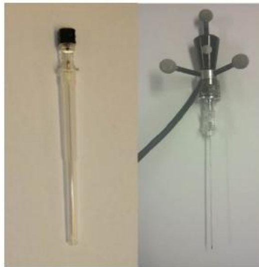
Fig. 3: Anesthetic (left) and instrumented (right) needles for position and force/torque measurement

To comply with the anesthetic needle insertion, a 22° bevel-tip needle was used. An ATI Nano 17 force sensor which has 6 degrees of freedom (3 force and 3 torque) was mounted to the handle of the needle to measure the instantaneous force that was felt by the user during the needle insertion. The force sensor had an ergonomic grasping device for ease of access of the haptic needle.