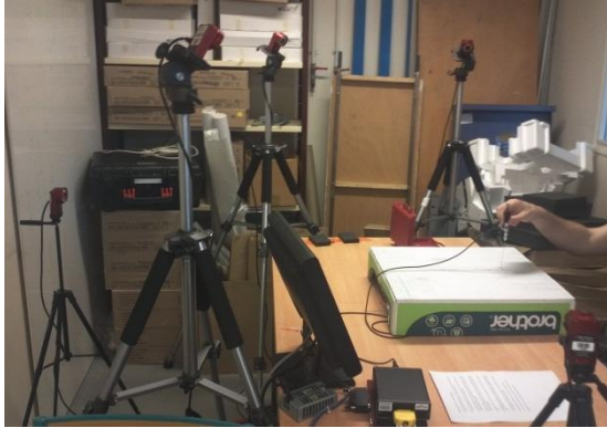
Fig. 4: Experimental setup