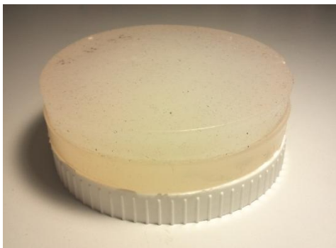
Fig. 2: The dual layer silicon sample

The task was designed to simulate needle handling during anesthetic needle insertion. Tissue was simulated using silicon samples (Figure 2). The participants were instructed to perforate the silicone using an anesthetic needle (Figure 3) until they reached the middle layer of the dual-layered gel samples. Depending on the experimental conditions, the task was performed with or without a visual aid which consisted of a real-time display for the forces applied by the participants on the needle.