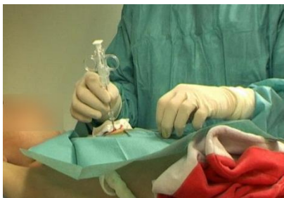
Fig. 1: Needle insertion in a biopsy procedure

In several medical procedures clinicians depend on their haptic perception abilities to insert needles in the patient; for example, in the administration of drugs and in radiological percutaneous needle insertions to perform biopsies as shown in figure 1: