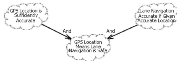
Figure 2: Simple Claim Refinement Model

in a claim refinement model. The refinement model for the example is depicted in Figure 2.