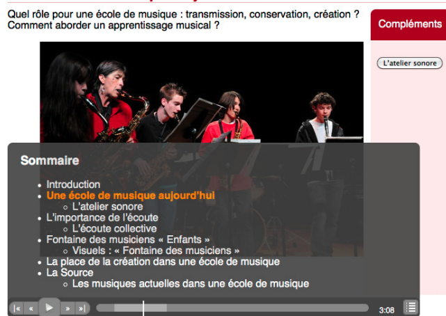
Figure 1: INA Webradio application

The idea is to propose a visually enhanced experience of a radio program, while allowing users to browse the content in a non-linear way, for instance with the table of contents (Sommaire) of Figure 1.