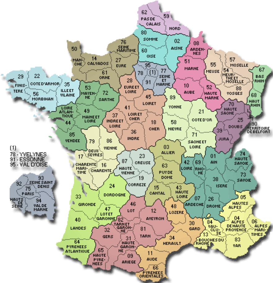
Figure A.1: French “départements”