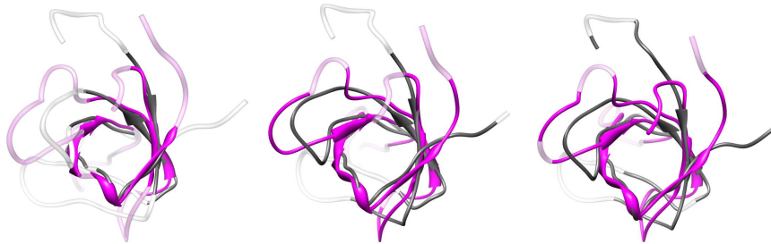
Fig. 3 Alignment of 1aawA (gray) and 1gxiE (pink), an instance of the Sisy set. Optimal superposition according to the respective alignment. Residues colored in dark tone are aligned, residues colored in light tone are unaligned. Left: The Sisy reference alignment (29 aligned residues, RMSD of 1.14). Middle: The heuristic DALI alignment correctly aligns all residues of the reference alignment, but extends the alignment length to 50 (RMSD of 2.55). Right: The optimal CMO alignment; it correctly aligns 96.55% of the aligned residues of the reference alignment. Alignment length is 56, RMSD 4.25. Additional gaps are inserted. Overaligning and insertion of additional gaps leads to a low RMSD value.

For global alignments of structurally very similar proteins, e.g. , Skolnick instances, the shift from a simple scoring function like CMO, to a more sophisticated scoring of all distances using for example the DALI scoring function, shows little effect. Nonetheless, our previous evaluation of the complete Sisy data set illustrates that for detection of more complex structural similarities, basic scores as CMO are not always sufficient to obtain gold-standard reference alignments, and the DALI scoring function performs on average better [23].