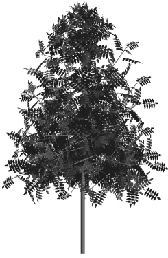
Figure 2. Simulation of acacia trees. a: tree protected from herbivore attacks, b: tree attacked three times (8,14, 20 time steps). Both trees are represented at 25 time steps.

[9]. This paper presents the coupling of an individual plant model with a simple model of herbivore attacks. Experimental data allow us to estimate GreenLab model parameters and reproduce tree growth, with architectural changes according to the intensity of herbivore attacks. However, due to the experimental design, the quantification of the attack intensity is not very precise. Thus measurements should be completed with data on plant growth dynamics. Likewise, definitions of the level of attack intensity should be refined, to allow us to validate this model more thoroughly.