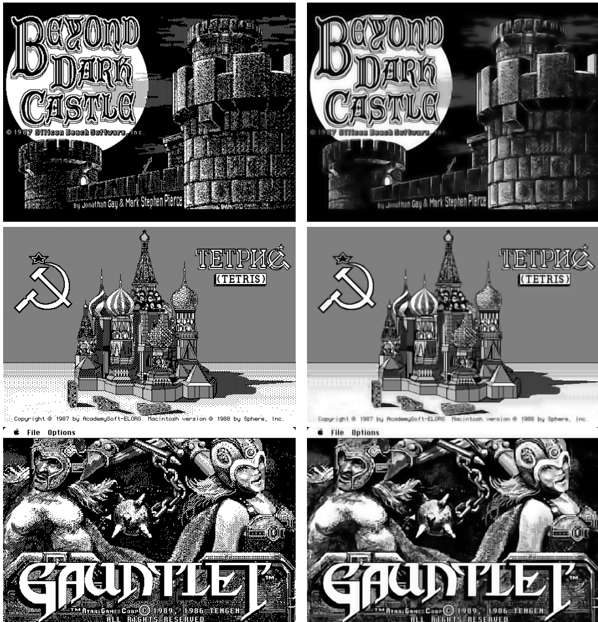
Figure 3: Results on various binary images publicly available on the Internet. No ground truth is available for these images from old computer games, and the algorithm that has generated these images is unknown. Input images are on the left. Restored images are on the right. Best viewed by zooming on a computer screen.