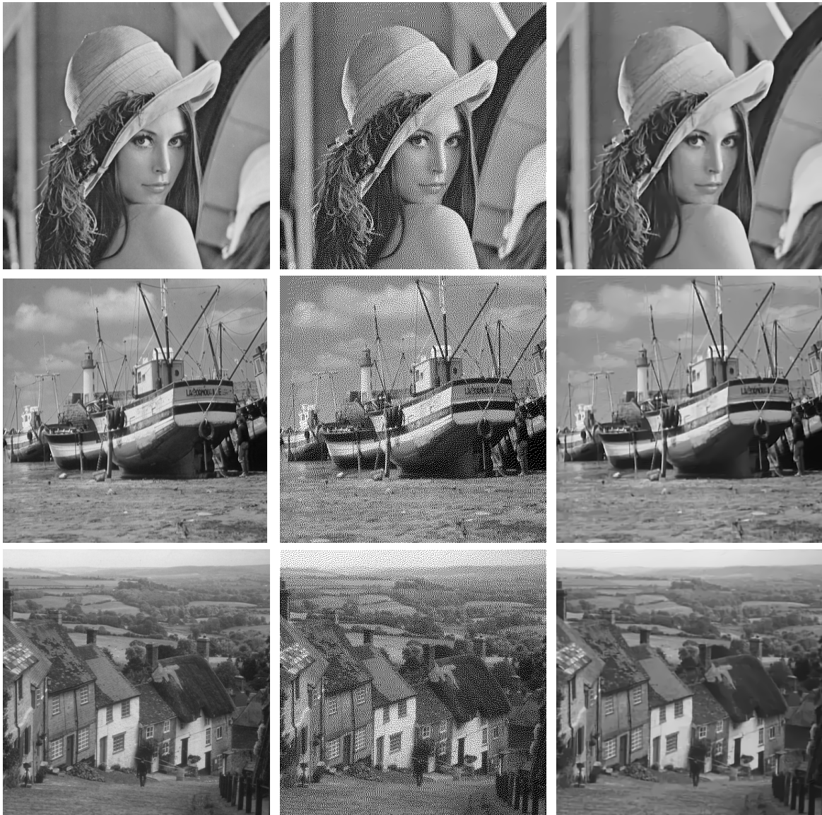
Figure 2: From left to right: Original images, halftoned images, reconstructed images. Even though the halftoned images (center column) perceptually look relatively close to the original images (left column), they are binary. Reconstructed images (right column) are obtained by restoring the halftoned binary images. Best viewed by zooming on a computer screen.