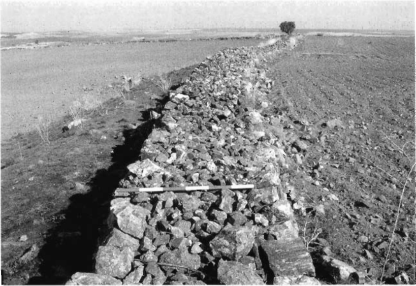
Fig. 31. El Pedrosillo (Casas de Reina). Wall from the major camp (J. G. Gorges & G. Rodríguez Martín).

The complementary defensive systems and annexed constructions. To the north of the main camping, to both part of the stream, the Roman strategists developed a complementary system of defense very elaborated, which turns to the complex of the Pedrosillo like one of more excellent the conserved catrastrales sets of Hispania . There are active defensive systems, like circular bunkers or redoubts ( castella ), or passive obstacles, as lines of stones ( titula ), or facilities that has taken advantage of natural pits formed by the bed the stream, that the own Romans have deepened.