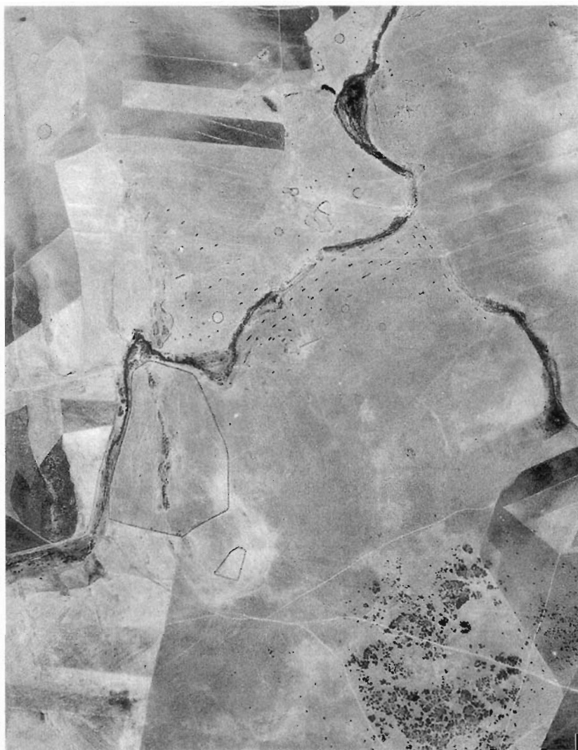
Fig. 29. El Pedrosillo (Casas de Reina). Aerial view (J. G. Gorges & G. Rodríguez Martín).