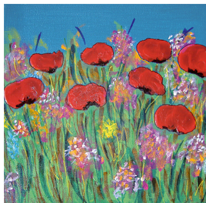
Figure 1. Coquelicots painting by artist Agathe Rémy, who lives near Aix-en-Provence, France. Coquelicots is the French word for poppies.

* Corresponding author: Eric.Lichtfouse@dijon.inra.fr