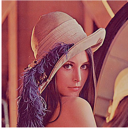
Figure 2: Unsharp mask with Hann kernel s_{H,1/2} = \frac{1}{2}s_H(\frac{1}{2}t) , a = -1.7 .