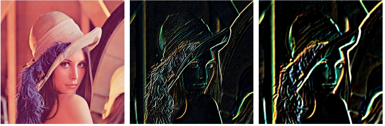
Figure 1: Original image, derivatives with Hann kernel \tilde{s}_H(t) = 2s_H(2t) and s_{H,1/4}(t) = \frac{1}{2}s_H(\frac{1}{4}t) ( \varphi = \frac{2\pi}{3} ).

Many image resizing (resampling) algorithms use such type of representation (see [16], [12], [6]). If the image data is exact, then we can take interpolating kernels s_1 and s_2 , like interpolating Hann, Blackman-Harris or Lanczos, and enlarge (up-sample) image, having (Sf)(j, k) = f(j, k) . If we want to reduce the image size (down-sample) (magnification \gamma < 1 ) then, for eliminating artifacts, we can choose a dilated kernel s_\alpha with in some sense optimal value of \alpha = 2\gamma (see Figure 2). The artifacts in down-sampled images appear, because details that are resized to smaller than one pixel will be misrepresented by larger aliases (see [5], [6]). Depending on the choice of the parameter value \alpha we have S_{W,\alpha} : C(\mathbb{R}) \rightarrow B_{\alpha W\pi}^\infty i.e. a function belonging to a class for bandlimited functions, for which the Fourier' transform vanishes outside of the interval [-\alpha W\pi, \alpha W\pi] . This approach eliminates higher spatial frequencies, being equivalent to the use of low-pass filter. Also in the case, when the resolution of the optical system is less than the resolution of the sensor, we can choose the value of the dilation parameter \alpha accordingly.