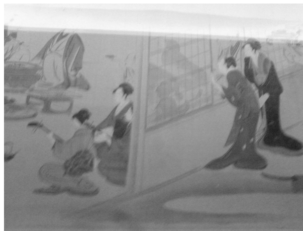
Figure 2. Chôbunsai Eishi, Going to Yoshiwara (detail), hanging scroll, ink and colors on silk, Idemitsu Museum, Tokyo.

the impression that these really are cast shadows. Two reasons militate in favor of the shadow interpretation. First, the definiteness of the projections on the shoji is not compatible with the possibility that what is here represented are people seen through a screen. Silk paper is not sufficiently transparent. Second, in the Eishi scroll, the last scene, which represents a bedroom, is set in a way that is analogous