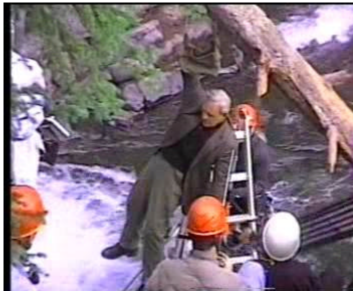
Figure 5: Actor Anthony Hopkins in a special effects arrangement in The Edge (1997)

Constraints for making physical special effects are much related to the physical environment in which the effect is to be put into action, and to the necessity to physically displace objects and arrangements. The materiality of the elements entering into construction creates a situation in which the re-production of an arrangement is almost as costly in terms of energy, time, and money, than the initial arrangement produced. In other words: the absence in physical arrangements of "copy" and "undo" represents a major constraint physical special effects makers have to take into account. Another type of constraint lies in the fact that an arrangement very often brings movie actors in direct contact with the objects used to produce the effect (cf. figure 5). The physical effects maker has to be ensured that no one on the movie set is being fragilized through the arrangement.