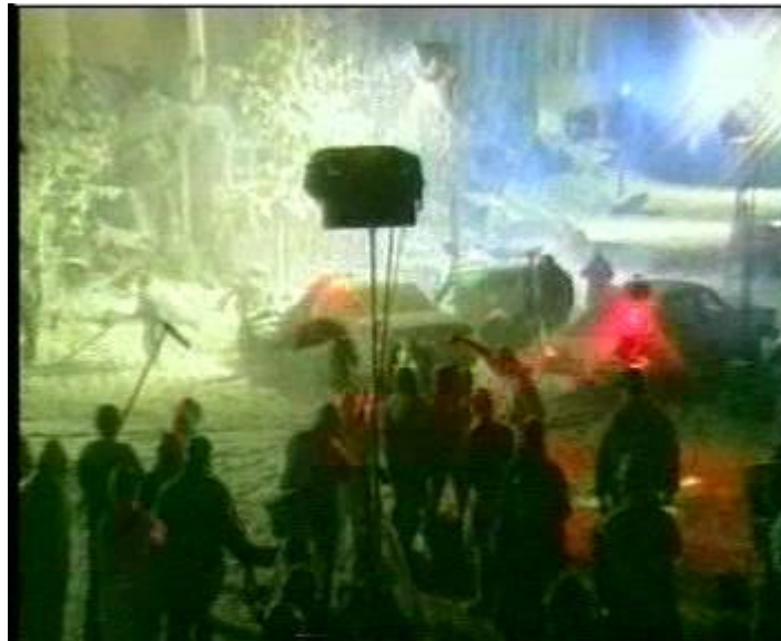
Figure 1: Dispersion of "volcanic ashes" (newsprint) on the set of Dante's Peak (1996)

The making of physical effects involves a repertoire of physical objects in a delimited physical space (Matarasso, 2002). This repertoire is constituted depending of the particular kind of effects or environment the effects makers focus on. Some specialize in modeling, while others, for example, develop particular competencies in effect making in hostile natural environments (e.g. high altitude). Despite specialization the variety of arrangements assembled by physical special effect makers is high ("never two times the same thing" Matarasso, 2002; translation by the authors). This demands a high versatility and connectivity of the objects in the repertoire as well as a thorough knowledge about the potential utilizations that can be attributed to an object.