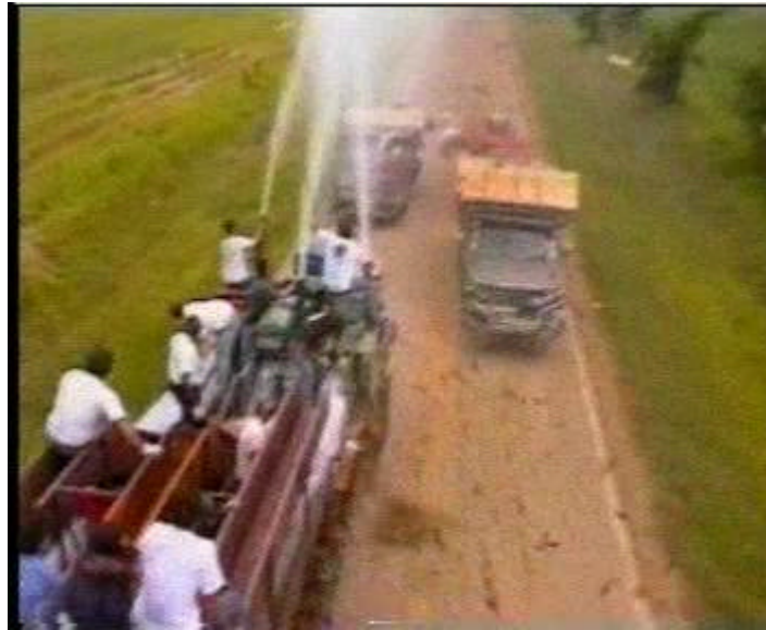
Figure 3: Creating an illusion of driving in a hurricane for Twister (1996)

Moreover, most physical effects demand the embedding of objects in a physical environment which itself does not belong to repertoire and is not under control of the effect maker. In consequence, the heterogeneous objects from the repertoire do not only have to hold among themselves, but they have also to go together with the physical environment in which the effect arrangement is situated in.