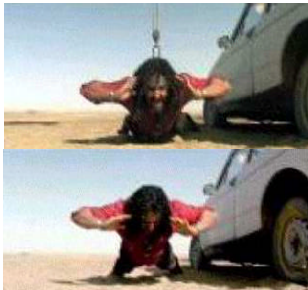
Figure 9: Complementarity of physical and digital effects in Le Boulet (2002)