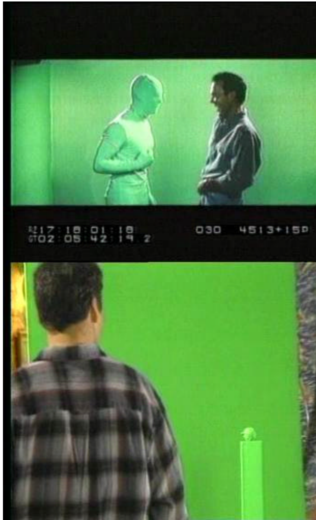
Figure 11: Physical objects on the set of Multiplicity (1996)