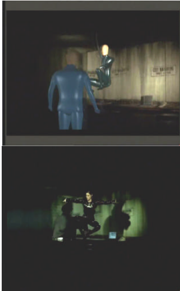
Figure 8: Virtual scene with incrustation of actor in Matrix (1999)