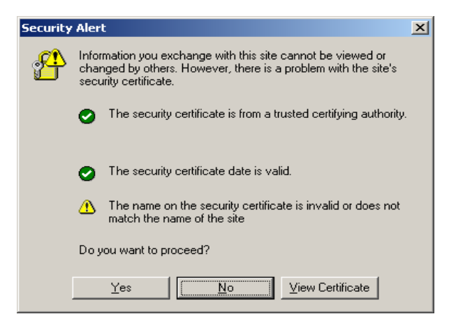
figure 3 : Window Security Alert

The theft can be unmasked if the voter verifies that the security certificate is known and valid. But a falsified safety certificate may have been accepted on the same computer during a previous connection to a web site thought to be secure, causing the display of a warning (see Figure 3). In this case, many users choose to continue, without being aware that they allow a potentially falsified safety certificate to join safety certificates that have been duly approved by certification authorities. Thus, when connecting to the fake voting web site, there will be no security alert.