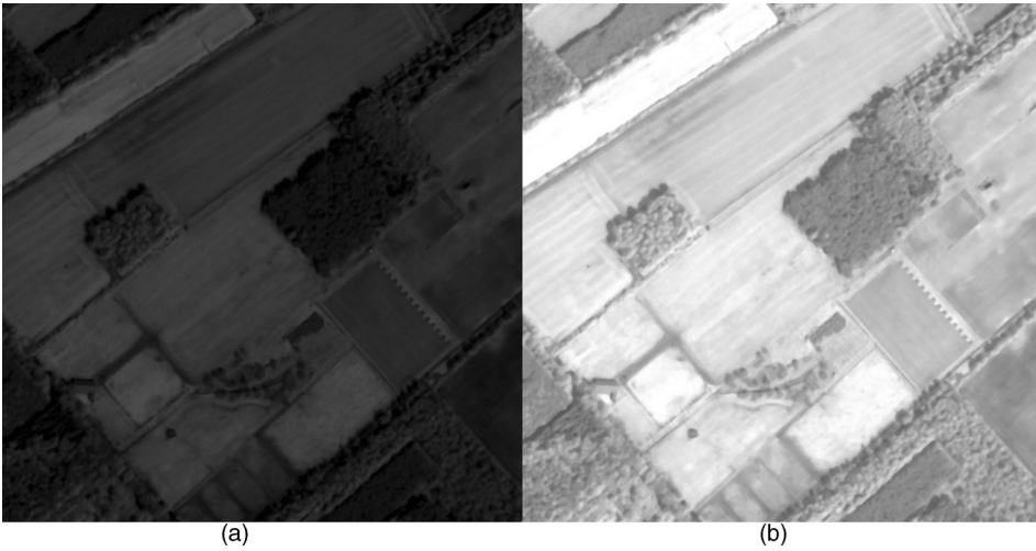
Figure 2. Ikonos image of fields and forests (left). Same image but after a multiplication of grey levels by two.