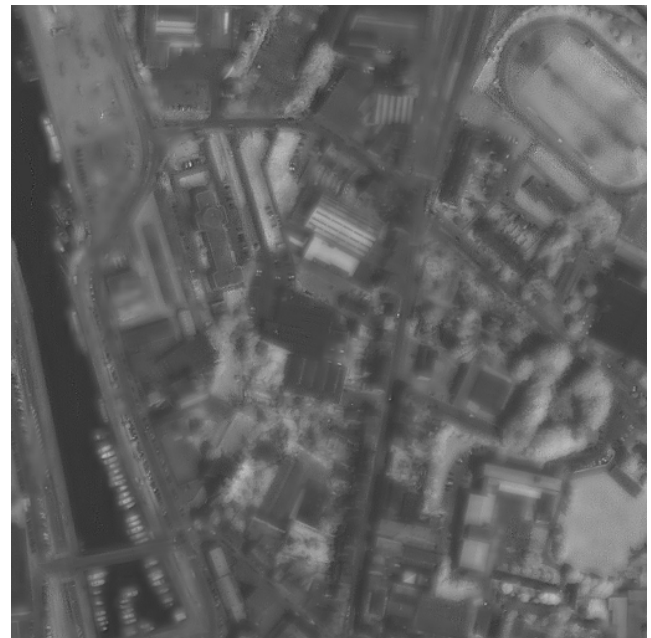
Figure 4. An excerpt of the image synthesized at 1 m by the UWT-RWM method.

The visual quality of each product is very different. The UWT-RWM image (Fig. 4) presents a smooth aspect. The objects are difficult to distinguish. One can observe a granular aspect (see e.g. the stadium). The objects are not enough contrasted. A kind of halo seems to surround many objects in the UWT-RWM image; see in particular the boats and the stadium. The UWT-ATS3 image (Fig. 5) is of better visual quality. The objects are easier to distinguish. However, the visual quality is not satisfactory. The UWT-M1 image (Fig. 6) presents a visual quality similar to the UWT-ATS3 one, but a bit inferior. The UWT-M2 image offers the best definition of objects. It allows a better recognition and identification of the objects in the image.