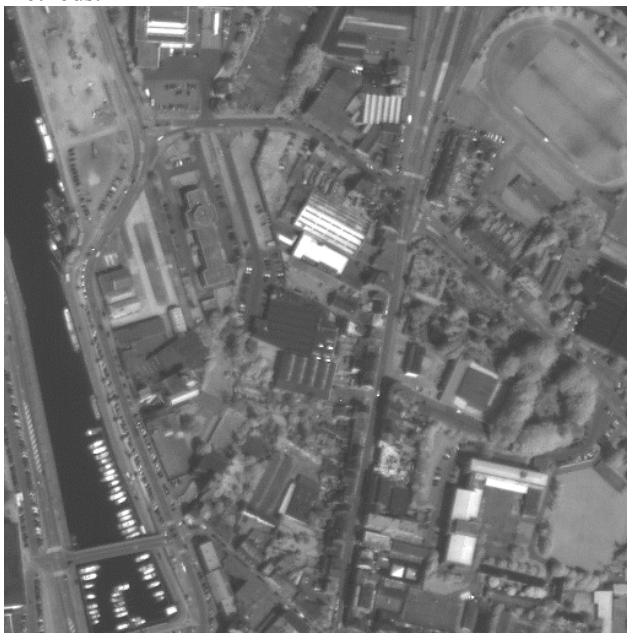
Figure 2. An excerpt of the PAN image at 1 m.

Figure 2 shows an excerpt of the PAN image at 1 m. On the left, there is a river, crossed by two bridges, with small boats and several barges. Along the river bank is a main street. Several cars are visible. This area is mainly an industrial district with large buildings, surrounded by numerous trees. On the top right is a stadium. Its lawn is partly degraded. Figure 3 presents an extract of the same area in near infrared (NIR) band with a spatial resolution of 4 m. This NIR band is generally the most difficult to synthesize and is a good comparison case for the different methods.