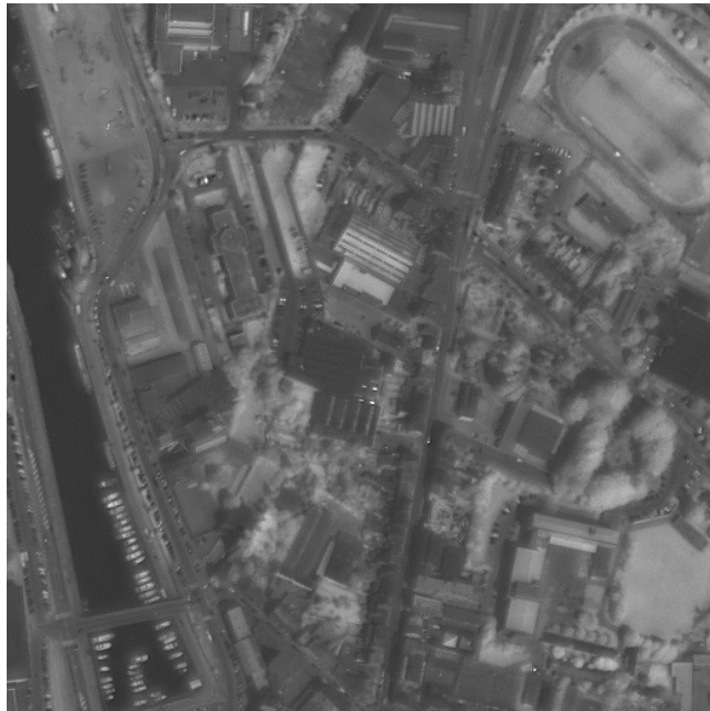
Figure 5. As Fig. 4, but for the UWT-ATS3 method.