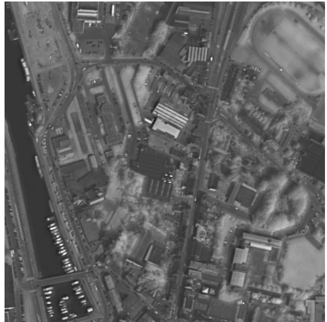
Figure 7. As Fig. 4, but for the UWT-M2 method.