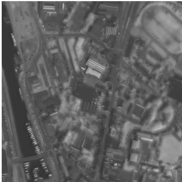
Figure 6. As Fig. 4, but for the UWT-M1 method.