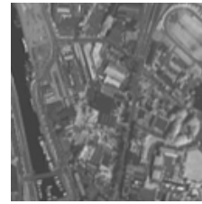
Figure 3. An excerpt of the NIR image at 4 m.