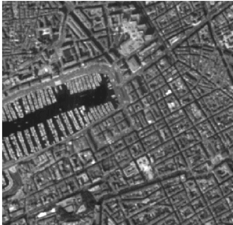
Figure 1. Panchromatic image of the oldest part of the city of Marseille, France. The spatial resolution is 2.5 m.