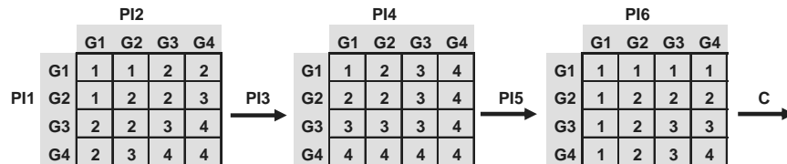
Figure 2. EACH CRITERION RESULTS FROM SUCCESSIVE AGGREGATION OPERATIONS

grade results from successive aggregations of indicators. Figure 2 provides three examples of aggregation tables: PI1 and PI2 are two indicators combined with a “mean” operator; the result (PI3) and PI4 are combined with a “Max” operator; finally criterion C is evaluated by combining PI5 and PI6 with a “min” operator.